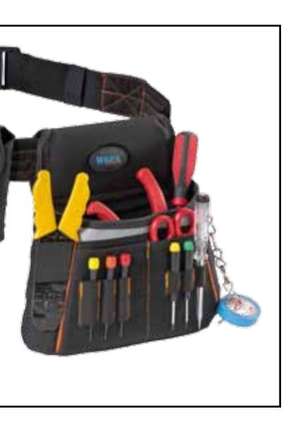
TOP PHONE N and TOP ELECTRA N