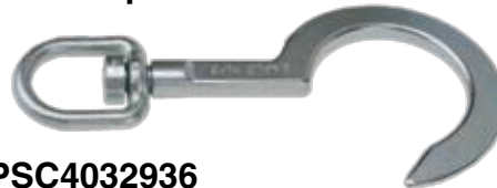
Swivel Hook Catalog No. PSC4032936 Weight: 1 lb. (0.45 kg.) Rated working load: 750 lb. (340 kg.)