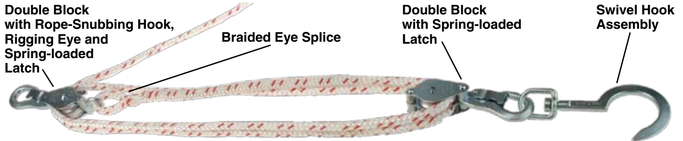
Complete Block and Tackle Set Weight: 4¼ lb. (1.93 kg.)